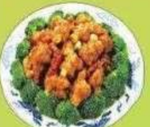
(P5) General Tso's Chicken