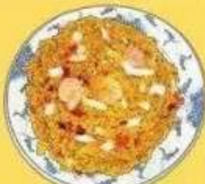
(P6) House Special Fried Rice