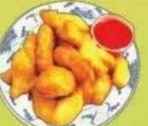
(P14) Sweet & Sour Chicken