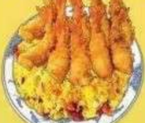
(P12) Fried Shrimp w. Fried Rice