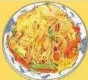
(P1) Singapore Mei Fun