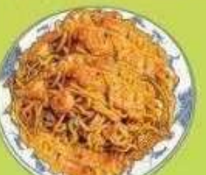
(P15) Shrimp Lo Mein