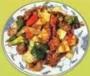
(P4) Hunan Beef