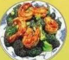
(P8) Shrimp w. Broccoli