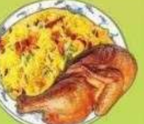
(P10) Fried Chicken w. Pork Fried Rice