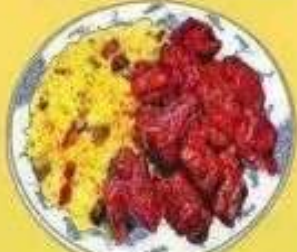
(P17) Spare Ribs Tips w. Pork Fried Rice