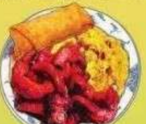
(P18) Boneless Ribs Combo