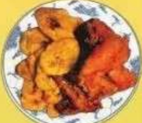
(P7) Chicken wing w. Fried Banana