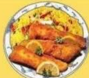
(P16) Fried Fish w. Fried Rice