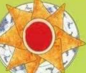
(P20) Crab Rangoon (8)