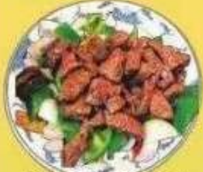
(P2) Pepper Steak w. Onion