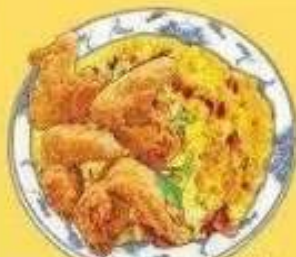
(P11) Chicken Wings w. Pork Fried