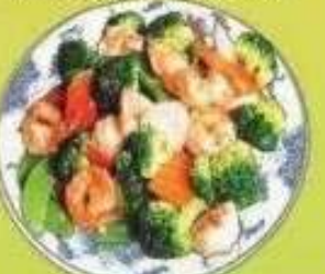
(P19) Shrimp w. Mixed Vegetable